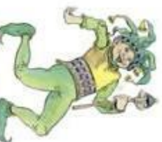
April Fools Day